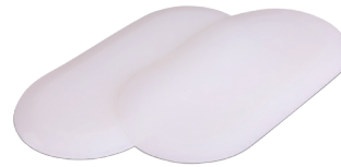
Alpha Silicone VMP, set of 2 Pad measures 9" x 4.5"; 4.5 mm & 7.5 mm thicknesses ALA-VM-S2