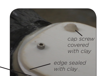
make sure aluminum is exposed all the wav around

Tape off the surface of the distal adapter to protect it from resin. Secure the distal adapter with 4 carbon struts.